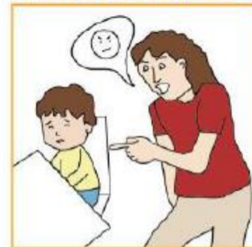
Harm to Your Heart or Mind