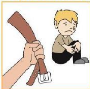
Harm to Your Body that Makes You Feel Pain