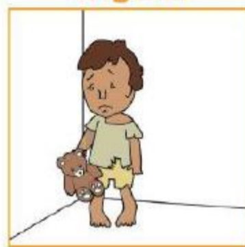
Carers Not Taking Care of You